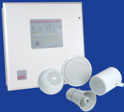
The AVAC Voice Alarm System

The AVAC is a low-cost, high-quality modular voice alarm system, purposely designed to simplify the provision of a fully BS5839-8 (1998) compliant voice alarm system.